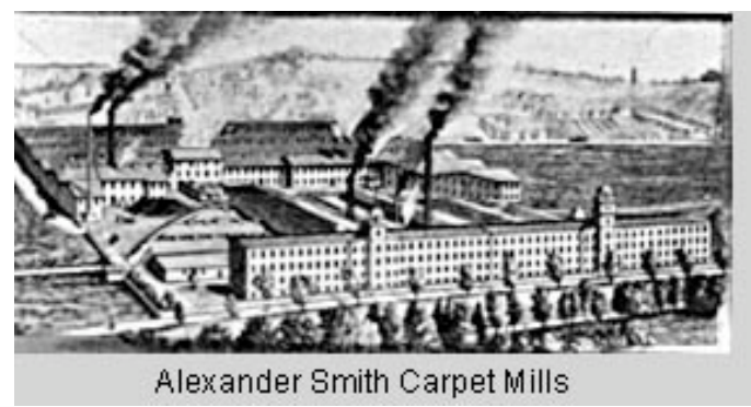
Alexander Smith Carpet Mills were a large part of Yonkers industrial history, and lent their name to this waterfront development plan.

The area included in the Master Plan redevelopment, the Urban Renewal and the Brownfield Opportunity is all the same. It is approximately 112 acres of waterfront property in general bounded by the Hudson River on the West, the Metro-North Railroad lines on the East, Wells Avenue and the Westchester County sewage pump station for the sewage treatment plant to the south, and JFK Memorial Drive to the north. There are two city-owned parks included in the project – the waterfront JFK Marina Park and the more inland Trevor Park, public open space areas such as a Westchester County park, the non-profit Beczak Environmental Education Center. In addition, the area includes the City of Yonkers Jail. There is also one section of property that extends inland two blocks between Warburton Avenue and the Metro-North Railroad. The main redevelopment area west of the Metro-North railroad tracks does not contain any residential uses or structures.